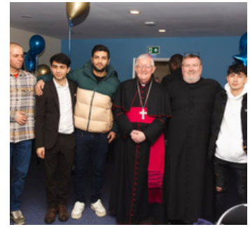
BLESSING OF NICOLAS BARRÉ HOUSE 18 JANUARY 2024