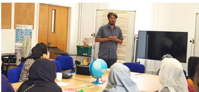
Pictured left: service users at the NHS interpreter focus group session in the Brushstrokes' training room.

This month at Brushstrokes we ran a very insightful focus group with our service users regarding their experiences of using interpreters when engaging with the NHS. Also discussed during the session were ways how our service users would like to receive digital information from the NHS when attending appointments and other health services. Given the diversity of languages spoken by our service users, considerable valuable feedback was garnered from this two-hour session which will be relayed to the Sandwell and West Birmingham NHS Trust.