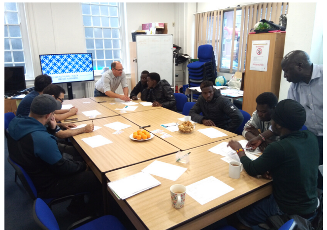
Pictured above: service users at the NHS information session in the Brushstrokes' training room.

A lot of those who we support at Brushstrokes are unfortunately unaware of how to receive the health care support to which they are entitled in the UK. The stresses and strains of living within the asylum system can certainly take a toll on people's mental and physical health, so it is vital that they can access suitable and timely health care. Due to this, Brushstrokes has been delivering Introduction to the NHS sessions to ensure that service users know what NHS services are available and when they should be contacted. We look forward to running more of these in the future.