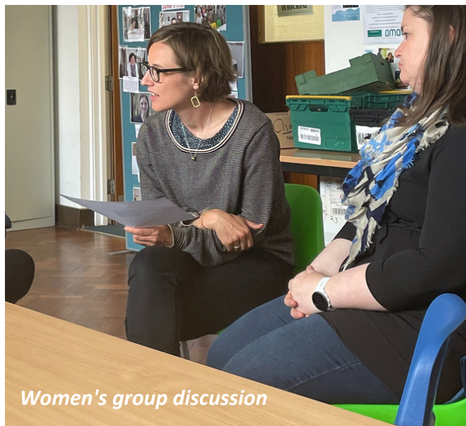
Women's group discussion

Our Brushstrokes Women's group is still going strong. Recently, we got our ladies together to talk on myths and misconceptions regarding child birth. This was an interesting session as it allowed our members to speak upon how child birth was for them, what they would do differently next time or how they would advice another person going through child birth. We went over some case studies which enabled our women to put themselves in the shoes of some people hypothetical scenarios, and discuss how they would navigate through the issues.