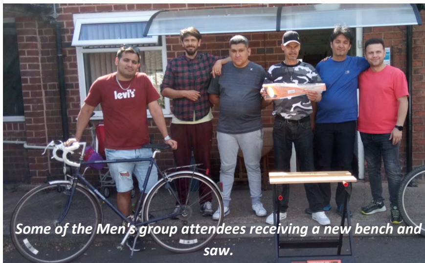
Some of the Men's group attendees receiving a new bench and saw.