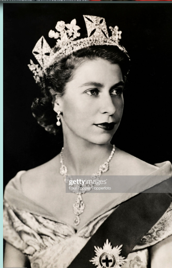
Queen Elizabeth II | 1926 – 2022

The BEM is very often awarded for 'hands-on' service to the local community. This could be long-term charitable or voluntary activity, or innovative work of a relatively short duration (3 to 4 years) that has made a significant difference.